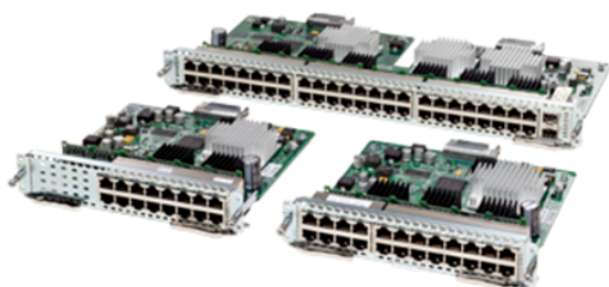
Figure 1. Cisco Enhanced EtherSwitch Service Modules

The Cisco Enhanced EtherSwitch Service Modules (Figure 1) greatly expands the router's capabilities by integrating industry-leading Layer 2 and Layer 3 switching with feature sets identical to those found in the Cisco Catalyst® 3560-E and Catalyst 2960 Series Switches. The new Cisco Enhanced EtherSwitch Service Modules are the first modules to take advantage of the increased capabilities on the Cisco 3900 and 2900 Series Integrated Services Routers. Additionally, these service modules enable Cisco's industry-leading power initiatives, Cisco EnergyWise®, Cisco Enhanced Power over Ethernet (ePoE), and per-port PoE power monitoring—all of which enhance the ability of the branch office to scale to next-generation requirements and still meet important initiatives for IT teams to operate a power efficient network. Furthermore, the Cisco Enhanced EtherSwitch Service Modules not only perform local line-rate switching and routing but also support direct service module-to-service module communication through the Integrated Services Router Generation 2 multigigabit fabric (MGF) which separates LAN traffic from WAN resources.